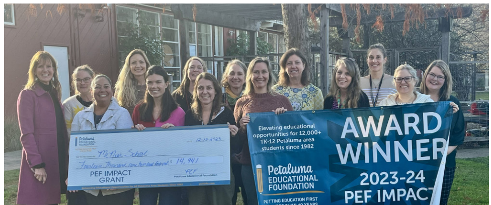
PEF Impact Grant Award presentation to McNear Elementary School

OVER $4.5 MILLION PEF Impact Grants awarded since 1982