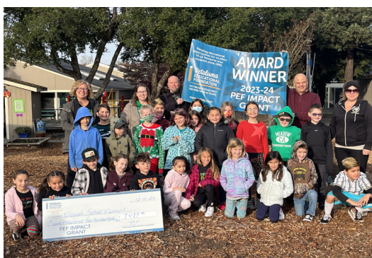
PEF Impact Grant for the Waugh School District Garden Program at Corona Creek & Meadow Elementary Schools

In 1982, several business leaders, community activists, and teachers in Petaluma convened to develop funding solutions for area schools in response to major budget deficits throughout the California school system. The outcome was the creation of the Petaluma Educational Foundation (PEF), a privately funded, non-profit organization whose primary goal is to raise money in the community to benefit education. As of the end of the 2023-2024 academic year, thanks to the generosity and vision of our supporters, PEF has awarded a cumulative total of over $9.3 million to students and schools in the Petaluma area through PEF Impact Grants and PEF Scholarships since the programs were established!